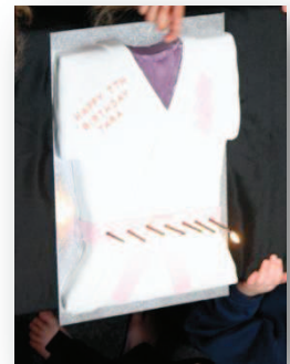
Karate Gi Birthday Cake